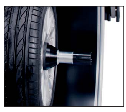
Patented power clamp device