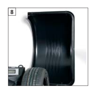
Wheel guard geodyna 990 (included in delivery of geodyna 990 mot)