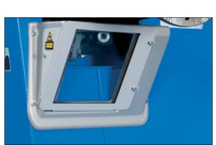
Non-contact data input via laser

Adhesive weights are placed safely and reliably in 12 h position using the patented geodata gauge arm and its special wheel weight clamp. Alternatively this job is made in 5 h position using the laser pointer.